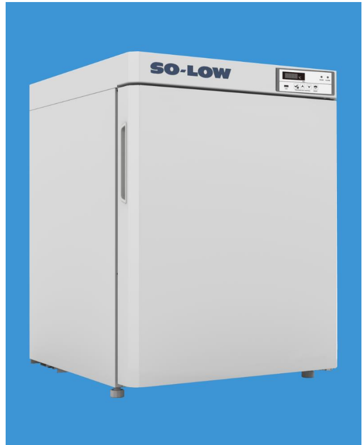
IMAGE BELOW DOES NOT SHOW OPTIONAL ACCESSORIES