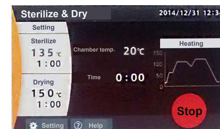
Sterilize & dry operation