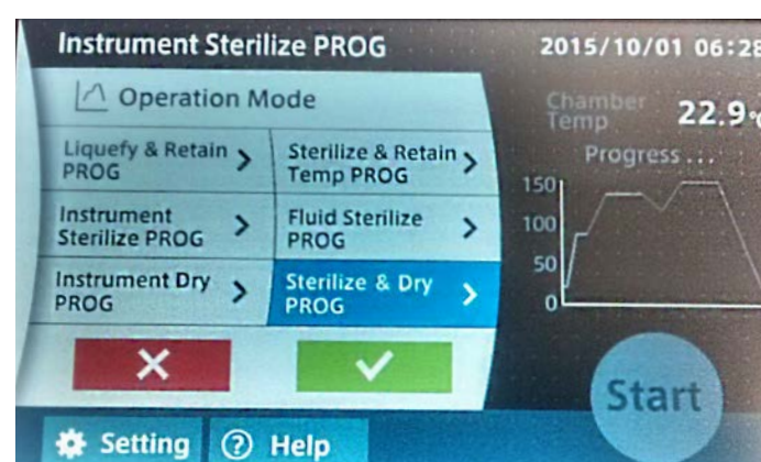
Sterilize & Dry Program