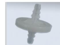
Air vent filter for tank