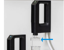
Water outlet cover