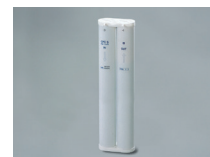
Ion-exchange resin cartridge