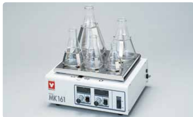
Example of using mounting stage and erlenmeyer flask holder clamps (optional)