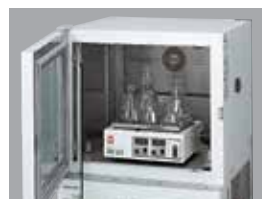
Incubator IN604W with optional slide shaker stage and MK161 shaker